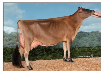
RIVER VALLEY SOCRATES ANTHEM II-ET, E-93% From the Same Family as Lot 1