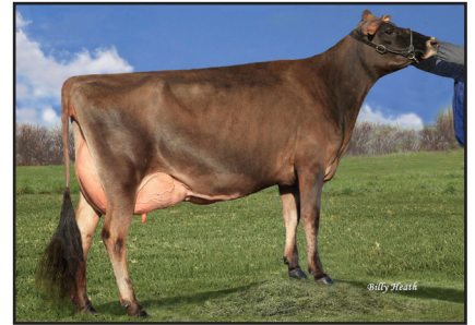
STONEY POINT VINDICATION FALINE Great-Grandam of Lot 11