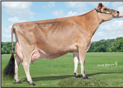
DEMENTS SAGE ROSEMARY Great-Grandam of Lot 12