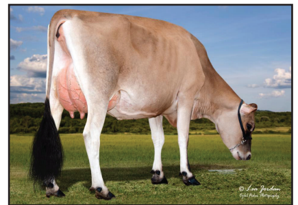
JX PVF PROP JOE ZAP {4}-ET, VG-83% From the Same Family as Lot 13

DAM: CLARESHOE MARVEL ZEALOUS USA 067461572 GT13K BBR 100 JH1F JNSC TATTOO /Z572 DHIA HERD # 31-15-1193 CONTROL # 1572 1-10 305 2 13940 4.8 665 3.6 499 96DCR 1725C 2-11 305 2 17330 4.5 779 3.6 619 97DCR 2104C 3-11 305 2 17650 5.1 893 3.8 667 97DCR 2308C 305 2X ME AVG 4L 17317M 815F 620P 2136C