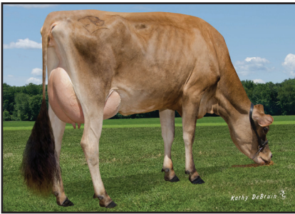
JX FARIA BROTHERS MARLO CHAPEL HILL {3}-ET Grandam of Lot 6