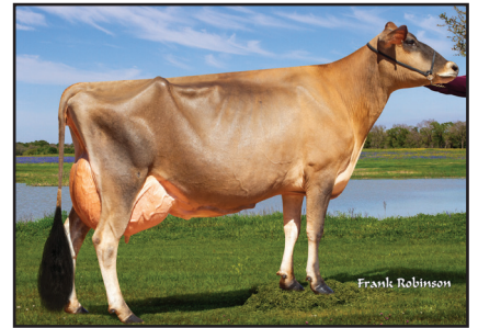
HER-MAN IRWIN DAZZLE-ET Sister to the Grandam of Lot 5