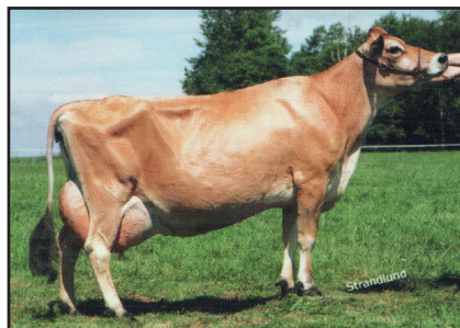
FAMILY HILL BROOK LYNNA, E-94% Fifth Dam of Lot 2