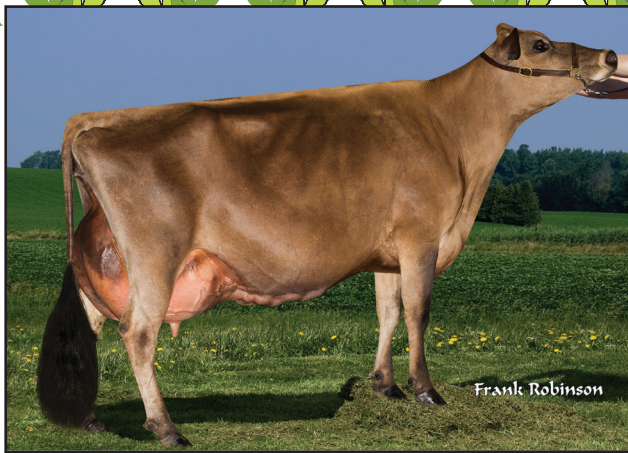
KKF COLOR TEQUILA CORDIE, E-92% Great-Grandam of Lot 9