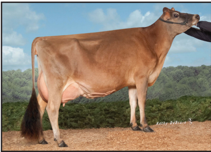
DEMENTS COUNTRY MILES ROXANNE Sister to the Grandam of Lot 12