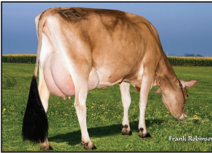
JX FARIA BROTHERS HARRIS JUVENTUS {5}-ET Great-Grandam of Lot 6