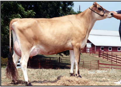
WILLIAMS IMPRESSIVE IDEA-ET, E-90% 3-5 305 20,096 4.7% 950 3.6% 715 Reserve Intermediate Champion, 2000 All American Jersey Show

One of the ‘landmark’ activities of the Buckeye Dairy Club has been the dairy cattle sale. The first sale was held in the Plumb Hall arena on May 16, 1981 and was titled “Buckeye Classic Calf and Heifer Sale” with only Holstein cattle being sold. There were 41 lots sold the first year. The Club received the College’s New Activity Award for the sale for the 1982-1983 academic year. By 1988, the title had become the Buckeye Classic Sale, it also included lactating Holstein cows, and it was moved to the Ohio State Fairgrounds.