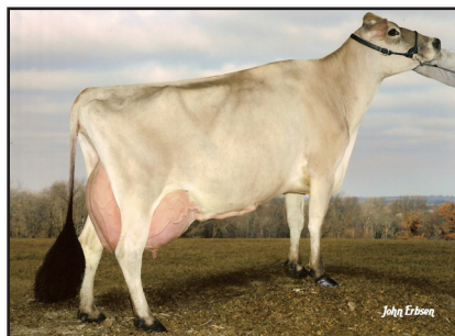
WELDY BLAIR TASHA, E-91% 5-2 305 21,860 5.7% 1238 3.7% 813

The Jersey portion of the sale has a rich history with many great cows selling through the years, including the four cows to the left. Williams Impressive Idea was not only the Reserve Intermediate Champion of the All American Jersey Show, but she is the dam of SC Golddust Paramount latola, the ONLY five-time Premier Sire of the All American Jersey Show in breed history. Many other great ones have also sold and represented the herds of our distinguished alumni and friends well.