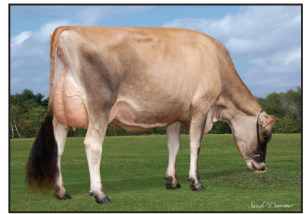
CLARESHOE ALLSTAR ZOOM ZOOM Sister to the Dam of Lot 13

GJPI 68%R 77 ST SR DF RA RW RL FA FU -1.0 0.0 1.4 H1.8 0.6 P0.4 S0.6 1.7 RH RUW UC UD TP TL RTR RTS 1.1 1.0 -0.3 S1.0 C0.3 S0.7 C0.5 C0.1