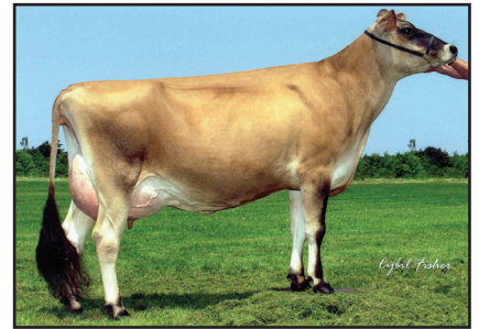
SHF SAMBO FUCHSIA, E-92% Fifth Dam of Lot 11