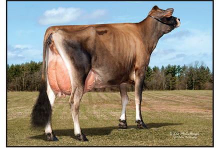
RATLIFF ACTION DAZZLE-ET Great-Grandam of Lot 5