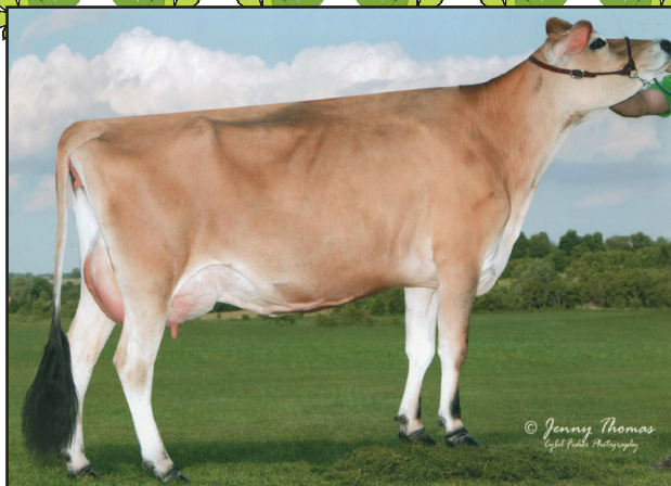
HARMONY-CORNERS LIBBY, E-93% Great-Grandam of Lot 2