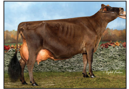
ARETHUSA PRIMETIME DEJA VU-ET Fourth Dam of Lot 5