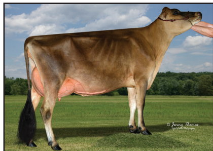
COLD RUN TEQUILA BAM BAM Dam of Lot 10