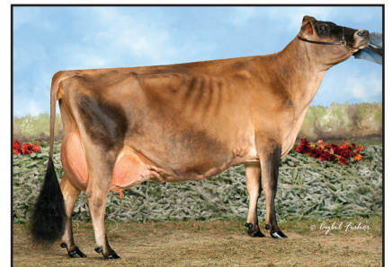
HURONIA CENTURION VERONICA 20J, E-97% Fifth Dam of Lot 5