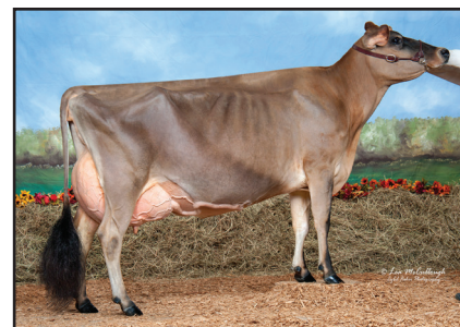
GOVERNOR ANGEL OF FAMILY HILL Great-Grandam of Lot 15

4TH DAM: FAMILY HILL FIRST NOEL-ET 91% 5-03 295 2 19280 4.1 792 3.6 695 97DCR 2232C