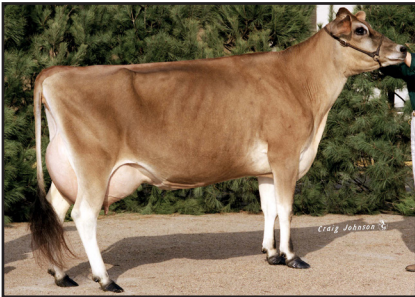
CANTENDO SOONER X RUBY, E-91% Sixth Dam of Lot 12

BORN 12/25/2019 PO FEMALE EFI 4.5% AMERICAN ID 681/681