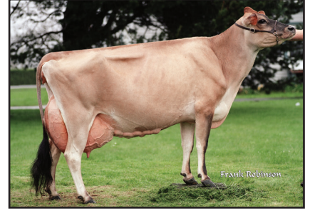
SUNSET CANYON MBSB ANTHEM-ET Fourth Dam of Lot 1