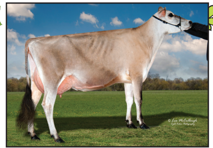
HER-MAN PREMIER DAZZLE Grandam of Lot 5

4TH DAM: ARETHUSA PRIMETIME DEJA VU-ET 95% 5-00 305 2 20000 5.0 996 3.8 763 96DCR 2640C SENIOR CHAMPION, 2011 KANSAS STATE FAIR 1ST 5-YEAR-OLD, 2011 KANSAS STATE FAIR 2ND 5-YEAR-OLD, 2011 WISCONSIN SPRING SPECTACULAR 3RD SR 2-YEAR-OLD, 2008 ALL AMERICAN 3RD SENIOR YEARLING, 2007 WI SPRING SPECTACULAR 5TH MILKING SENIOR YEARLING, 2007 CENTRAL NATIONAL 6TH 5-YEAR-OLD, 2011 CENTRAL NATIONAL 7TH 5-YEAR-OLD, 2011 ALL AMERICAN OPEN JERSEY SHOW