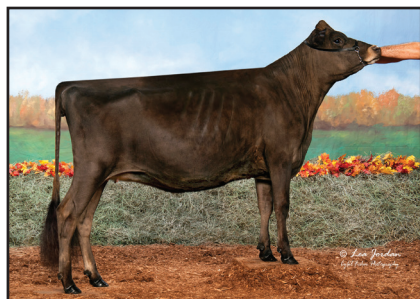
COLD RUN ANDREAS BETTY BLOWTORCH Sister to the Dam of Lot 10

BORN 03/01/2020 PO FEMALE EFI 6.4% AMERICAN ID 309/309 PA -1352M -20F -29P -149CM$ -164NM$ -200FM$ -0.6PL -0.5DPR -1.2CCR -0.1HCR 3.15SCS PA TYPE 1.1 JPI 43%R -61 ST SR DF RA RW RL FA FU 1.7 0.1 1.3 H0.7 0.5 S0.1 S0.5 1.5 RH RW UC UD TP TL RTR RTS 1.1 0.8 1.4 S1.8 CO.9 L1.3