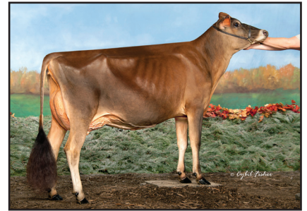
MILK & HONEY VADEN FERN-ET Sister to the Dam of Lot 11