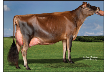
STONEY POINT BELMONT FASHION Grandam of Lot 11

SISTER(S): STONEY POINT GATOR FESTY 90% 5-04 305 2 18200 4.5 811 3.5 644 98DCR 2189C STONEY POINT IATOLA FLOJO 90% 2-10 305 2 20080 5.1 1021 3.5 697 98DCR 2409C STONEY POINT GATOR FANTASIA-ET 91% 1-11 305 2 13630 4.5 616 3.7 506 96DCR 1688C STONEY POINT TEQUILA FELISHA-ET 90% 2-01 305 2 15020 4.6 685 3.5 529 97DCR 1828C STONEY POINT TEQUILA FELOSHA-ET 85% 2-01 258 2 8160 4.8 395 3.9 317 90DCR 1072C STONEY POINT TEQUILA FELASHA-ET 86% 1-10 305 2 17100 5.3 910 3.7 633 102DCR 2189C STONEY POINT COLTON FAIDRA-ET 88% 3-00 293 2 13550 5.2 711 4.0 545 97DCR 1887C