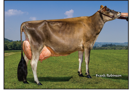
SUNSET CANYON HG FINAL ANTHEM Sister to the Grandam of Lot 1