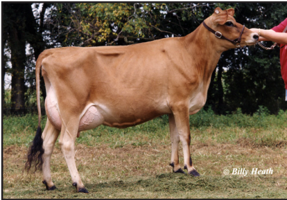
WF/L&M FRANCO BENNI, E-90% 2-1 305 15,480 3.8% 590 3.7% 575 2nd Two-Year-Old, 1998 Ohio State Fair

One of the ‘landmark’ activities of the Buckeye Dairy Club has been the dairy cattle sale. The first sale was held in the Plumb Hall arena on May 16, 1981 and was titled “Buckeye Classic Calf and Heifer Sale” with only Holstein cattle being sold. There were 41 lots sold the first year. The Club received the College’s New Activity Award for the sale for the 1982-1983 academic year. By 1988, the title had become the Buckeye Classic Sale, it also included lactating Holstein cows, and it was moved to the Ohio State Fairgrounds.