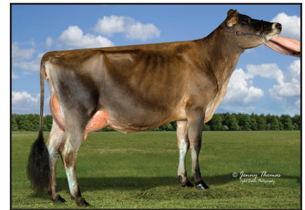
GOJ CORDIE GOVERNOR CAROLINE Sister to the Grandam of Lot 9

SISTER(S): GOJ CORDIE GOVERNOR CAROLINE 88% 3RD SR 3-YEAR-OLD, 2018 INDIANA STATE SHOW RESERVE INTERMEDIATE CHAMPION, 2018 IN STATE JR SHOW 2ND SR 3-YEAR-OLD, 2018 INDIANA STATE JUNIOR SHOW 4TH JR 2-YEAR-OLD, 2017 INDIANA STATE FAIR 3RD JR 2-YEAR-OLD, 2017 INDIANA STATE FAIR JR SHOW GRAND CHAMPION, 2017 INDIANA STATE JUNIOR SHOW SENIOR CHAMPION, 2017 INDIANA STATE JUNIOR SHOW 1ST SR 2-YEAR-OLD, 2017 INDIANA STATE JUNIOR SHOW 1ST SR 2-YEAR-OLD, 2017 INDIANA STATE SHOW RESERVE GRAND CHAMPION, 2017 INDIANA STATE SHOW RESERVE SENIOR CHAMPION, 2017 INDIANA STATE SHOW