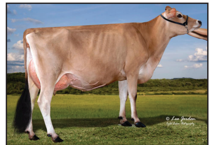
JX PVF PROP JOE ZIP {4}-ET, VG-85% From the Same Family as Lot 13 Dam of JX PVF WC ZINC {5}-ET 1JE1074

ALL LYNNS VALENTINO MARVEL USA 117422971 GT50K BBR 100 JH1C 11JE1118 CDCB GPTA S 12/01/2020 10809DAUS 397HRDS 3%RIP 99%R 179M -0.02% 4F 40%ILE 99%R -0.02% 2P 182CM$ 184NM$ 192FM$ 116GM$ 4.0PL 3.7LIV -1.1DPR -0.4CCR -0.9HCR 2.875CS 0.2MFV 1.0DAB 0.3KET 0.0MAS 0.1MET -0.4RPL 6.71HTI AJCA 12/01/2020 4770DAUS GPTAT 99%R 0.8 GJUI 8.2 GJPI 99%R 45