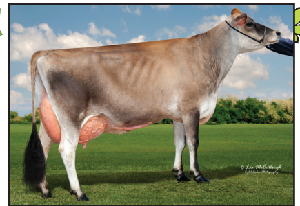
SUNSET CANYON HG ANTHEM-ET Grandam of Lot 1

SISTER(S): SUNSET CANYON HG FINAL ANTHEM 91% 4-10 305 2 21920 4.1 899 3.4 736 80DCR 2456C 3RD SR 2-YEAR-OLD, 2015 WESTERN NATIONAL SHOW SUNSET CANYON TOPEKA F ANTHEM 84% 3-01 305 2 16290 5.1 834 3.6 592 97DCR 2047C SUNSET CANYON ANTICIPATED MOTION-ET 66% 3-01 251 2 10140 4.4 443 3.6 365 101DCR 1215C SUNSET CANYON MOTION F ANTHEM-ET 79% 1-08 305 2 12590 5.1 639 3.6 457 94DCR 1580C SUNSET CANYON MOTION ARTICHOKE-ET 83% 3-09 285 2 15550 4.4 677 3.5 539 95DCR 1829C SUNSET CANYON HG ANTHEM 467 85% 1-10 288 3 19500 5.1 986 3.8 742 103DCR 2567C SKANDIA CITATION ANTHEM-ET 82% 3-02 305 2 14290 4.5 646 3.6 521 96DCR 1756C SKANDIA CITATION F ANTHEM-ET 90% 3-11 295 3 24000 4.7 1130 3.7 897 97DCR 3053C SKANDIA A ANTHEM 47692-ET 88% 2-02 305 3 16720 4.6 764 3.6 608 103DCR 2065C SKANDIA A ANTHEM 47718-ET 73% 2-05 239 3 9830 5.2 516 3.9 383 89DCR 1325C SKANDIA SPARKY F ANTHEM-ET 87% 3-11 305 3 24420 4.9 1208 3.8 923 95DCR 3193C SKANDIA SPARKY ANTHEM 986-ET 80% 1-07 305 3 17130 5.1 877 3.9 663 96DCR 2294C SKANDIA SPARKY ANTHEM 988-ET 81% 2-11 305 3 23080 4.7 1085 3.7 848 95DCR 2912C