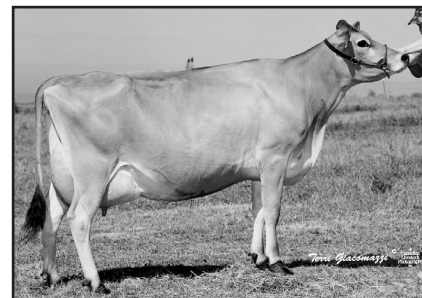
FAMILY HILL LESTER ALLISON-ET, E-92% Fifth Dam of Lot 15